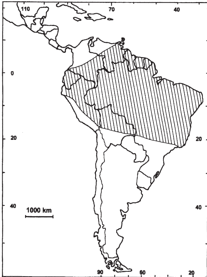
Fig. 3.—Geographic distribution of Choeroniscus minor .